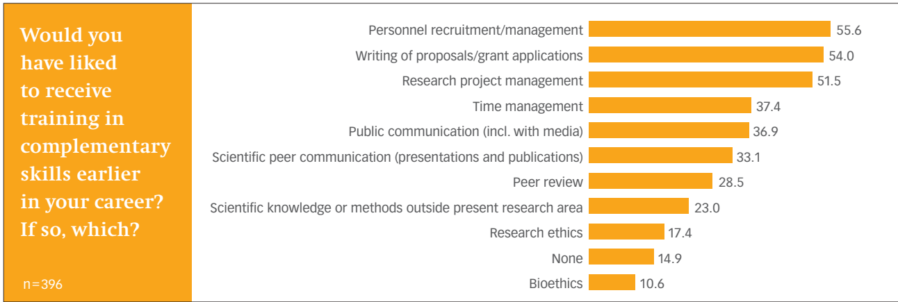
Box 2 | Percentage responses of senior scientists as to the areas of complementary skills in which they would have liked to receive training earlier in their career.