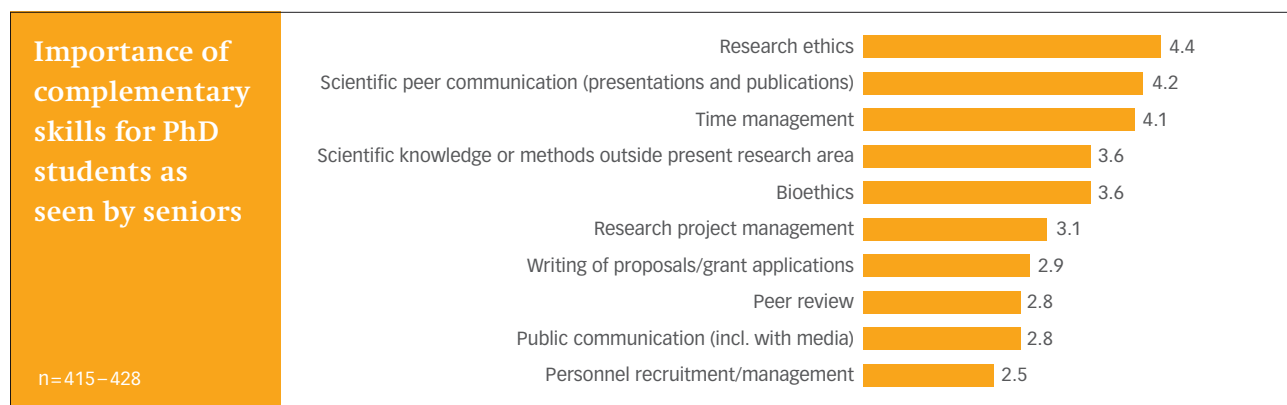
Box 1 | Mean score attributed to the importance of various skills for PhD students by senior scientists, on a scale of 5 (very important) down to 1 (unimportant).

and 3. Administrative and management skills occupy the top third ranking in terms of popularity of answer (between 56 and 30% of respondents). But public communication skills also rank highly (almost, or just within the top third in popularity) – much higher than the graphic in Box 1 would suggest. In fact, this finding suggests that senior scientists unjustly downgrade the importance of public communication skills for young scientists, whilst recognizing them as relatively important for themselves. When, indeed, should they be learnt?