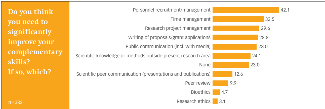
Box 3 | Percentage responses of senior scientists as to the areas of complementary skills in which they think they need to improve significantly.