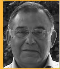
2005 Winner: Edoardo Boncinelli

The European Molecular Biology Organization launched this award in 2002 in order to give recognition to the huge efforts that some scientists make to communicate their science to the public while remaining active in research.